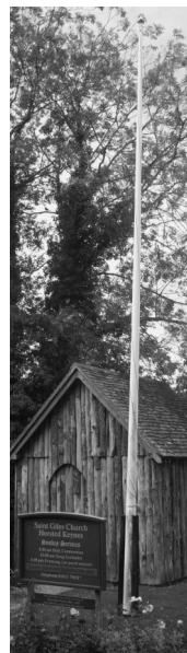
As it was

Our most recent flag pole was (surprisingly to some of us who remember a timber flagpole being erected as a generous legacy) made of fibreglass. It was held vertical, bolted between two lengths of railway line set deep in concrete. In flag pole parlance, this support is called a tabernacle and was probably first constructed to support the square sides of the bottom of the previous timber pole. The tabernacle steel uprights have gradually rusted away and, finally, the winds from that extraordinary run of named storms we've had so far this winter made the pole loose in its fixing bolts and to tilt alarmingly, until there was nothing to be done but to call on a professional team to lower and remove the damaged pole. So who was most to blame? Was it Agnes in September 2023, Babet in October, Ciaran or Debi in November, Elin, Fergus or Gerrit in December, or Henk, Isha or Jocelyn in January 2024?